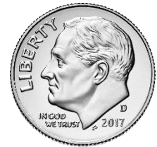
6061 T6 Aluminum plate used in an electronics assembly. US dime as size reference.