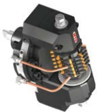
GEAR HOBGING UNIT