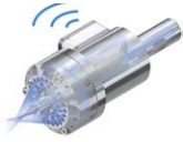
COOLSPEED® MAX Ultra-high-speed spindle with speed measuring