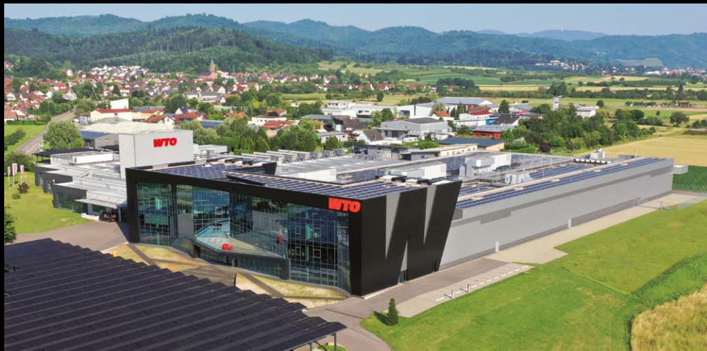
Company Headquarters Ohlsbach, Germany