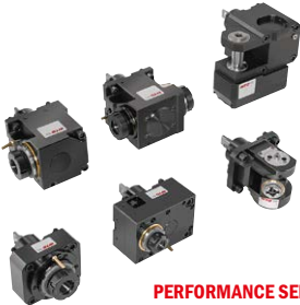
PERFORMANCE SERIES® Second generation