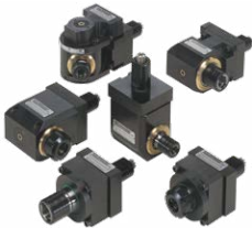
COMPACT SYSTEM First generation DTH for turning centers