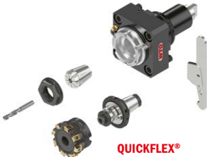
QUICKFLEX® Third generation DTH with quick change system